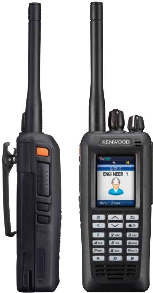
TK-D200(G)/D300(G) Display model